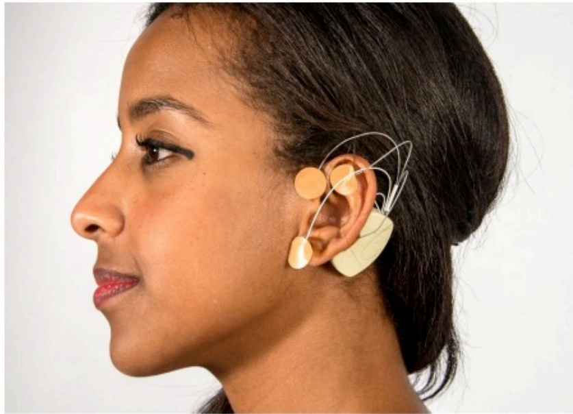
Military Field Stimulator/Neuro-Stim System.